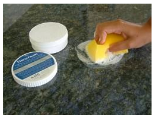
3. Squeeze the sponge to produce foam