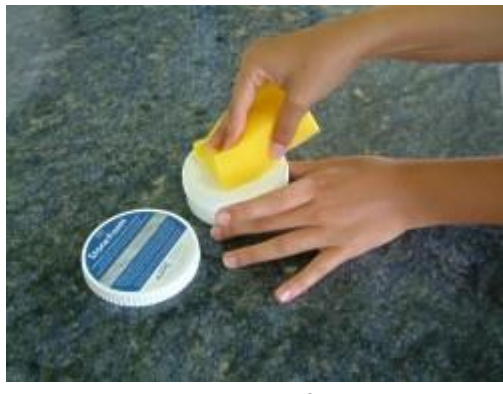
2. Wipe the wet sponge a few times over the paste