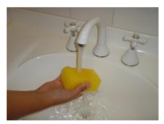
1. Wet Sponge with tap water

How to clean with Stone Foam PASTE for amazing results: