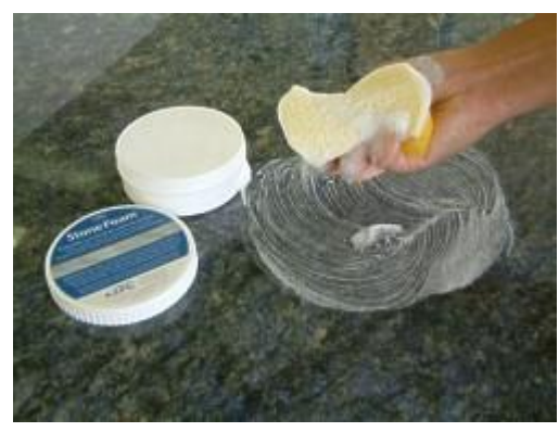
4. Gently wipe the foamy sponge onto the surface. Use gentle circular motions.